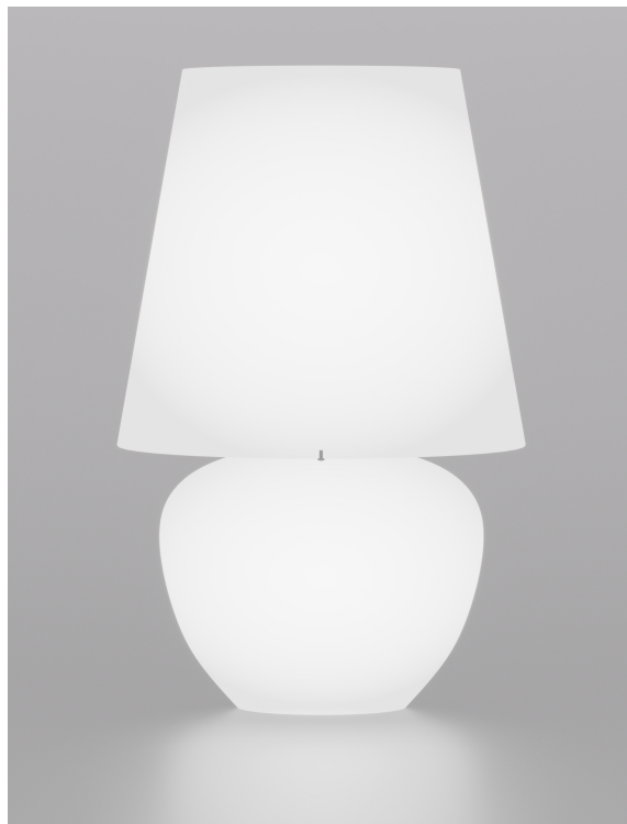
NAXOS LT 76 BCST BC INC CE